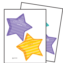
Stars 2 per page