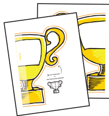
Trophy 2 Pages